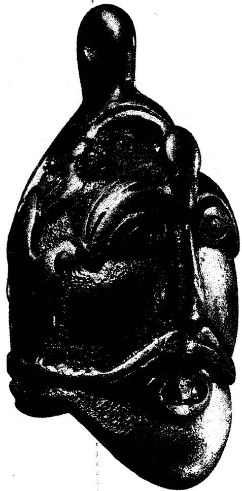
Silver pendant showing the helmet of the Vendel (Early Viking period, 10th century), Statens Historiska Museet, Stockholm

He leaped into the lake, would not wait for anyone's Answer; the heaving water covered him Over. For hours he sank through the waves; 470 At last he saw the mud of the bottom. And all at once the greedy she-wolf Who'd ruled those waters for half a hundred Years discovered him, saw that a creature From above had come to explore the bottom 475 Of her wet world. She welcomed him in her claws, Clutched at him savagely but could not harm him, Tried to work her fingers through the tight Ring-woven mail on his breast, but tore And scratched in vain. Then she carried him, armor 480 And sword and all, to her home; he struggled To free his weapon, and failed. The fight Brought other monsters swimming to see